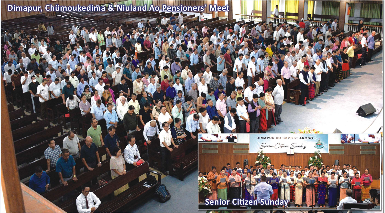
Dimapur, Chümoukedimā & Niuland Ao Pensioners' Meet