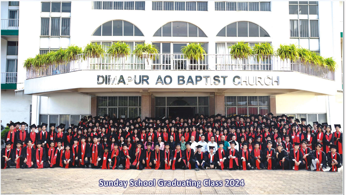
Sunday School Graduating Class 2024