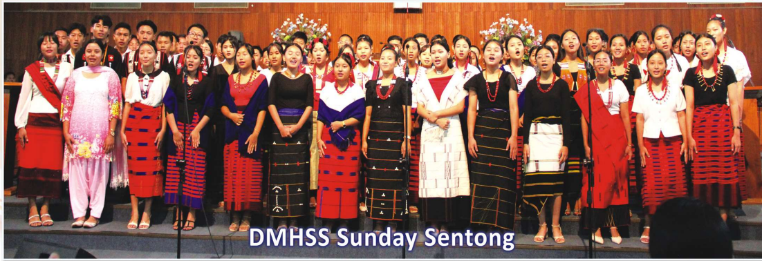
DMHSS Sunday Sentong