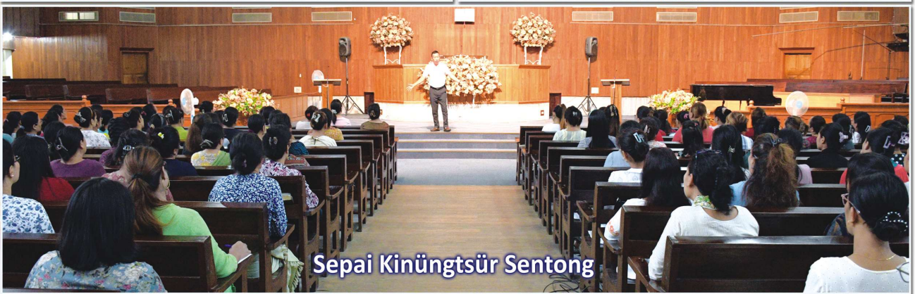
Sepai Kinüngtsür Sentong