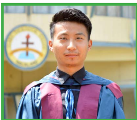
DELONG Town Fellowship | Aliba Clark Theological College, Degree: B.D Planning for further studies.