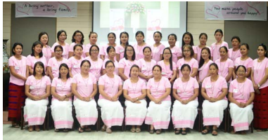
Duranno Mothers School 2 nd Batch

Tsüngremer sentong nung anema lira asen Arogo nung June ita tatemlen agitsü sarasadema renemdagi.