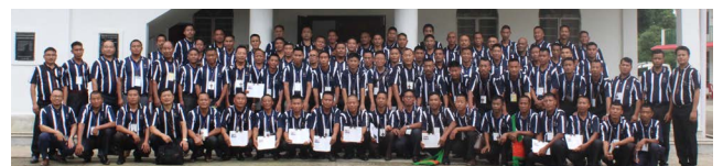
Police Baptist Church 6 th NAP Bn. Tizit 60 th Batch