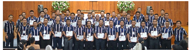
Duranno Fathers School DABA 58 th Batch

Ano küm tsüngta asen Arogo nung Nagamese agi ken aser Ao nung ken ta agitsü; aser tanga Arogo nung asem ben agitsü renema lir. Anungji, shirnoksa Fathers School nung mateni lir, atentsü asoshi sarasadema lidaktsüner, aser iba ministry asoshi arogopur ajaki maneni sarasademjangma.