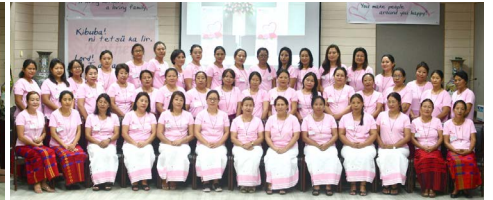
Duranno Mothers School 3 rd Batch