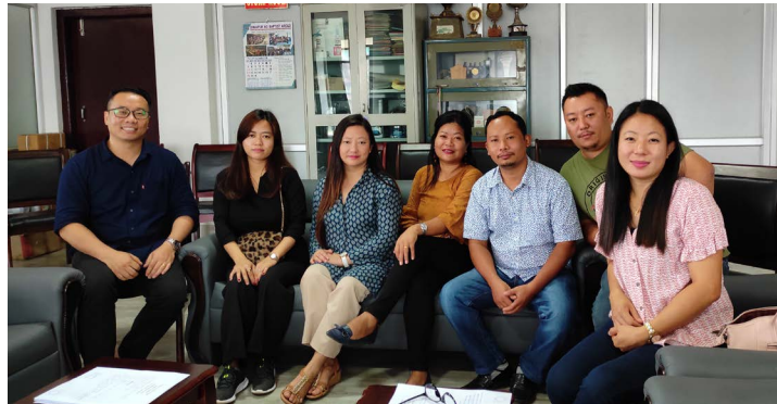
Youth Evangelists Morning prayer