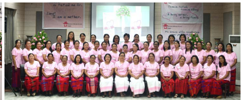
Duranno Mothers School 5 th Batch