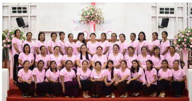
Duranno Mothers School (Khensa) 4 th Batch